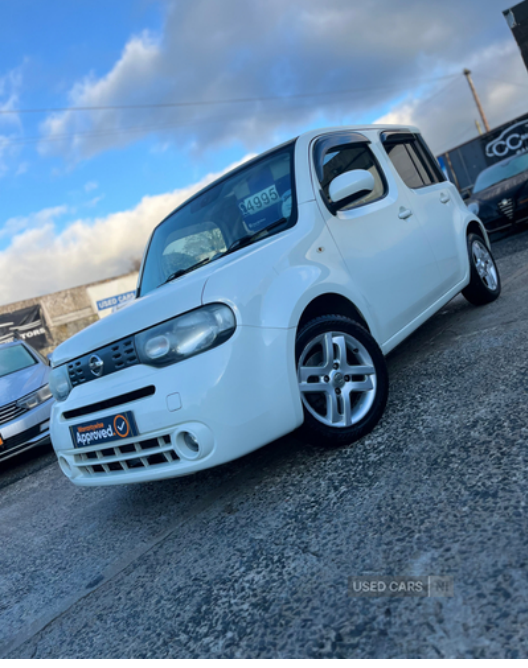
2010 Nissan Cube AUTOMATIC 1.6 petrol

FINANCE AVAILABLE - own this from £152 per month with no deposit & no final payment, all finance subject to status!